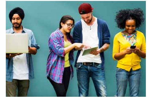
Choosing subjects and courses at 18